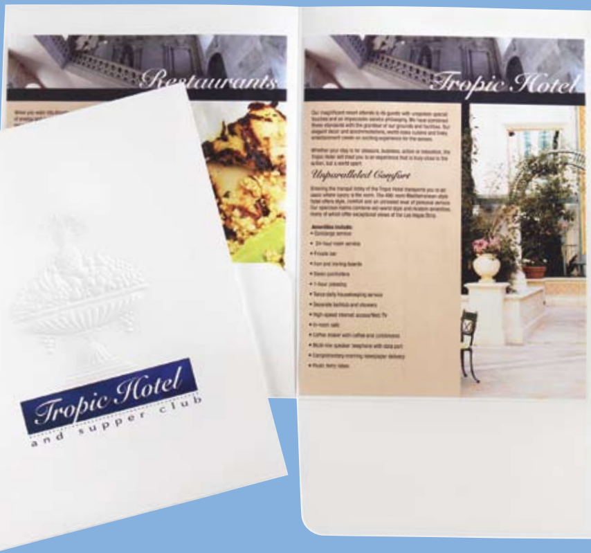
Loose Pocket Folders come with unglued pockets.

Item Number UF8-A-1 (one unglued pocket) Style A-1 Item Number UF8-A-2 (two unglued pockets) Style A-2